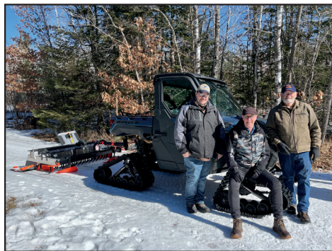
New 2024 Polaris Ranger for Itascatur Club grooming

Happy Trails! Follow us on Face Book and on our website. Itascatur.org