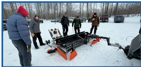
In 2026 MNSA conducted Minnesota's first ever On Snow Grooming Clinic at the Sugar Hills Trail system.