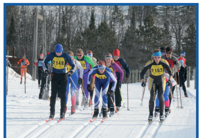
Hosting Ski Races/Events